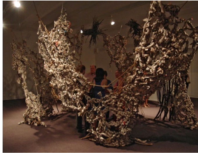
Left: Ashioke II . 2008. Clay and burlap. 28 x 35 x 4 in. Right: Twisted Ambience . 2009. Newspapers, sticks and twine. Varied dimensions.