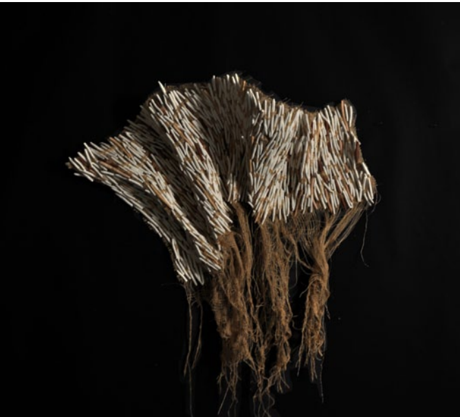
Left: Bark and Fibre . 2009. Clay, burlap and jute fibre. 47 x 45 x 4 in. Right: Igba Nkwu . 2008. Clay and rope. 49 x 42 x 5 in.

Okore, in her adopted city Nsukka, was struck by the rawness of aspects of the landscape surrounding the township. People there were not concerned with form or fashion; indigenous practices coexisted with western trends and ideas. Their rich use of materials like the colourful swaddling cloth, akwa , that women wear, the adobe homes, the natural flora and bush found in forests, even the hills and rocky terrain informed her aesthetic. Twisted Ambience is a contorted array of newspaper rolled and configured into tree-like structures mimetic of the over powering presence of a dense forest she remembers